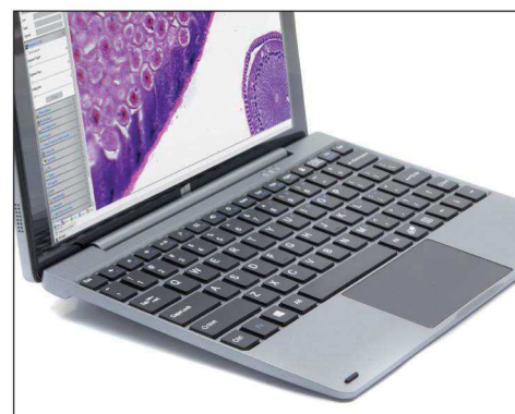
TB-KBD2 - Accessory keyboard for tablet