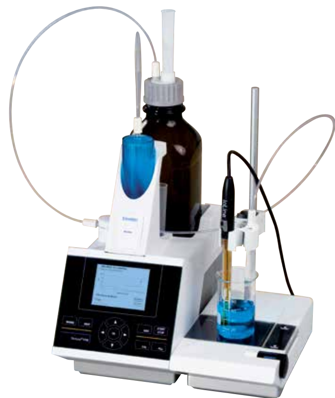
TitroLine® 7750 with accessories for potentiometric titration

The new TitroLine® 7750 is characterized as follows: