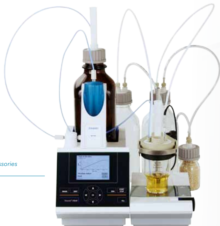
TitroLine® 7750 with accessories for KF titration