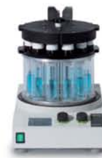
Multivapor™ P-6 / P-12 Évaporation efficace pour plusieurs échantillons

11595014 fr 1410 A / Les caractéristiques techniques peuvent être modifiées sans préavis / Systèmes de qualité ISO 9001. La version anglaise est la version originale et sert de référence à toutes les traductions.