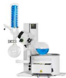
Rotavapor® R-100 Évaporation économique