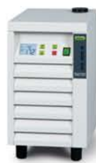
Recirculating Chiller F-100 / F-105 La méthode de refroidissement la plus simple