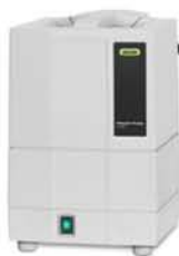
Vacuum Pump V-100 La source d'aspiration économique