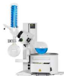
Rotavapor® R-100 Évaporation économique