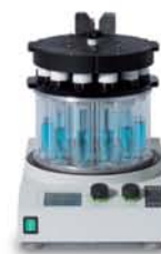
Multivapor™ P-6 / P-12 Évaporation efficace pour plusieurs échantillons