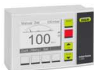
Interface I-100 Régulation de vide économique