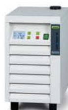
Recirculating Chiller F-100 / F-105 La méthode de refroidissement la plus simple